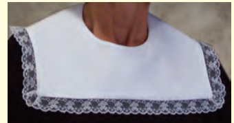
#9963 Square Collar

Dress up your judicial robe with one of our optional lace collars. Collars are made in washable polyester with attached lace. Snap at back of neck. Available with pointed front, rounded front and square front. Available only in #66 Oxford Visa fabric (white or black).