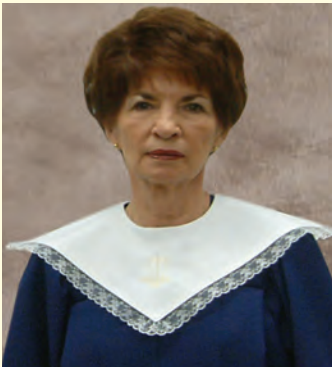
#9964 Pointed Collar