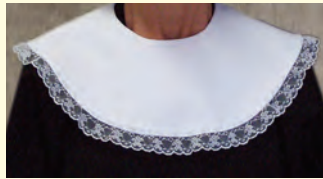
#9962 Round Collar